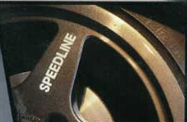
Top smart Speedline alloys look the absolute biz and get the girls wetter than a November weekend in Llanfuduo

most people go berserk at what they reckon is a touring car on the road, they fail to peer past the stickers. But if you take the time to look inside the Alfa you'll discover hidden depths.